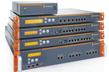
Astaro Hardware Appliances

Ready-to-go virtual machines for VMware environments, helping you to consolidate your IT infrastructure.