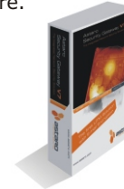
Astaro Software Appliance