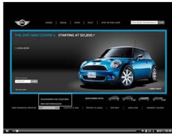
TechSmith ExpressShow (Mini Cooper is a mark owned by BMW AG)

"This is one that pleases the experts and the newcomers alike. There is simply no other screen capture and production tool in the same class. If you need to accurately capture what is displayed on your screen and then easily present it to a target audience in a professional manner then Camtasia Studio is the only choice. It always leaves my users wondering how I did it."